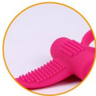
Brush design Friction enjoyment

Soft small particles rub Experience different enjoyment